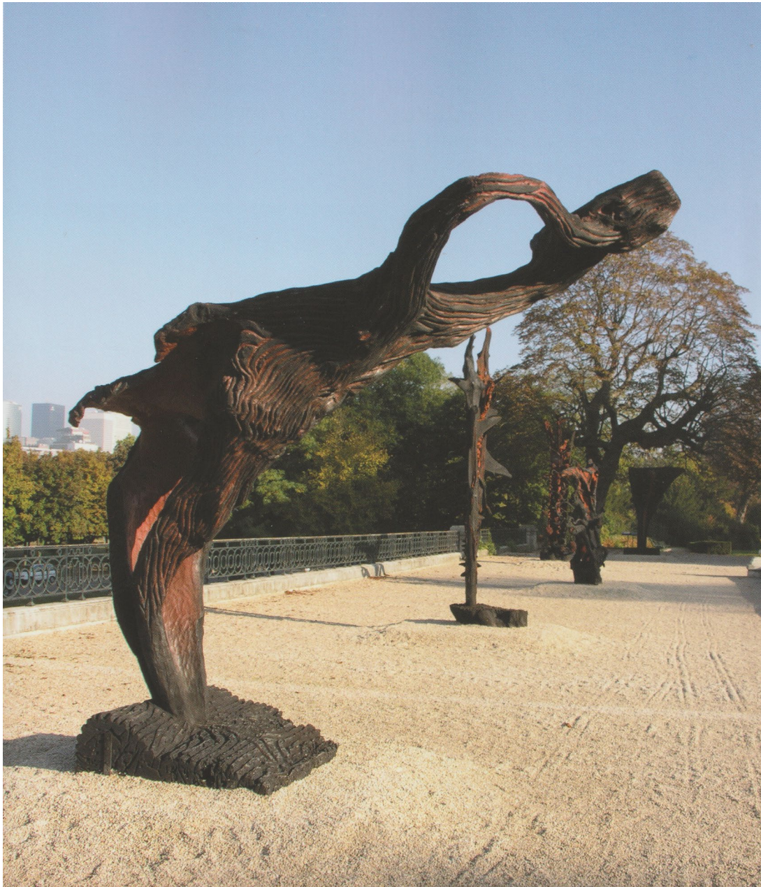
Figure 1: Révolte. Natural pigment over trunks. Frans Krajcberg: Un artiste en résistance, 2017.